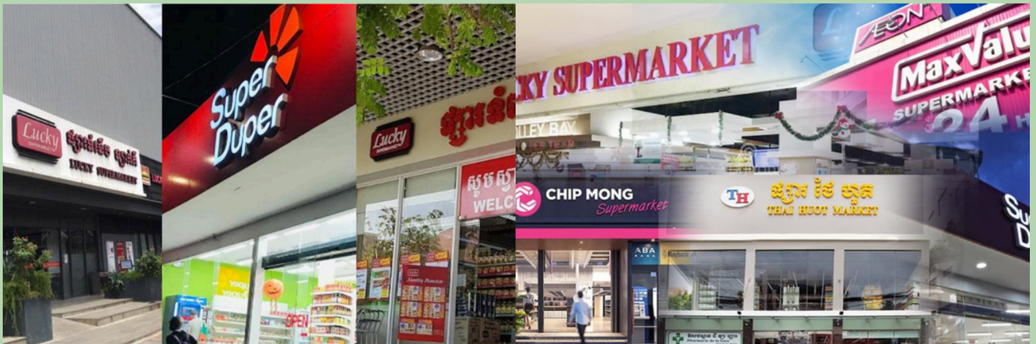
AEON MALL Phnom Penh

These stores offer a great selection of European products – cheeses, cold meats, pasta, sauces and condiments – which will allow you to cook